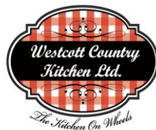
Westcott Country Kitchen

www.westcottcountrykitchen.com (403) 335-0000 (403) 439-1222